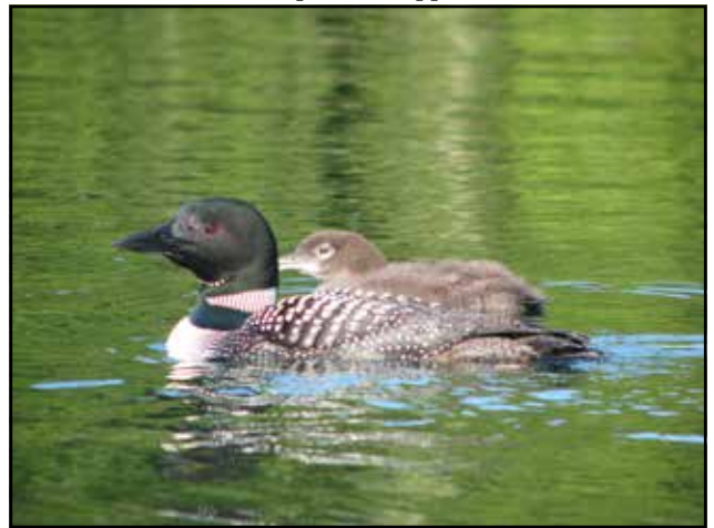
A loon and its chick.

This year we again summarized our audited financial information to show the impact of our Nature Matters capital campaign in 2015 and 2014 as compared to regular operations. Complete Audited Financial Statements and the Form 990 Tax Return may be found on our website, www.nhnature.org , under the tab for Support.