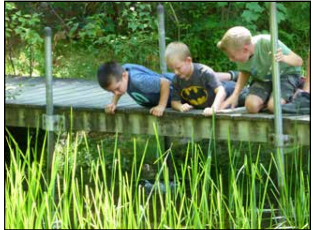
Visitors explore the Upper Pond.