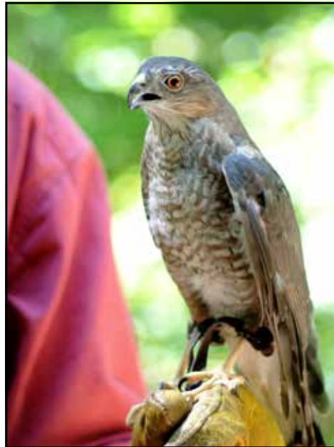
A sharp-shinned hawk at an Up Close to Animals presentation.