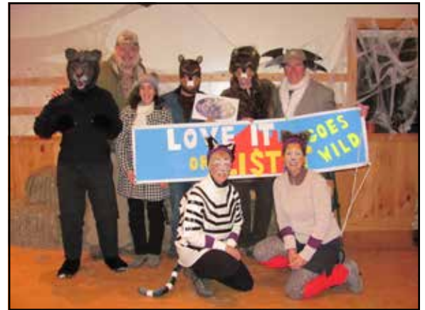
Staff in costume at the Halloween Hoot 'N Howl.