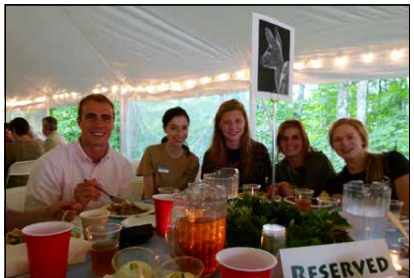
Science Center Interns enjoy the meal.