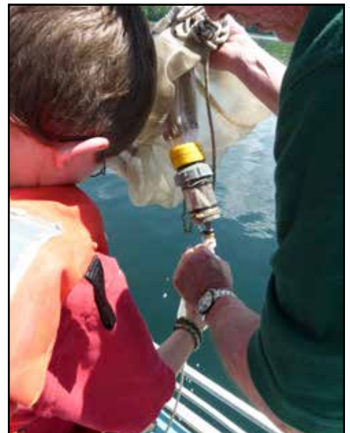
A student learns about water quality in a lake ecology program.