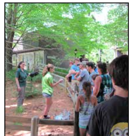
Docents and First Guides show off a live owl.