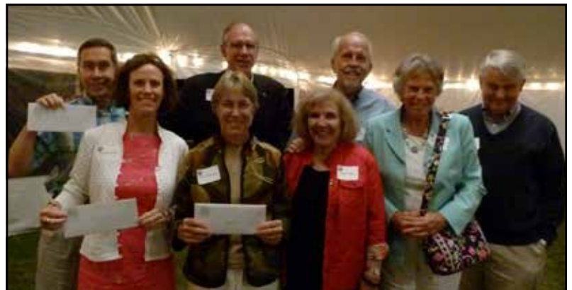
Winners of the trivia challenge.