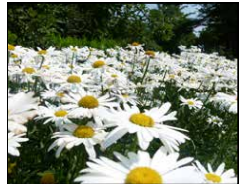
Shasta Daisy, Leucanthemum x superbum , in bloom at Kirkwood Gardens.