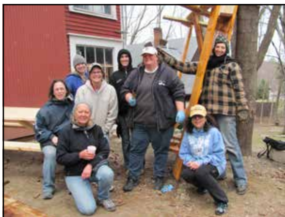
A group from J. Jill helps on Clean Up Day.