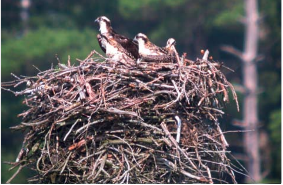
Three large Osprey chicks and mom at the big old nest in a heron rookery in Hill, NH. 7/2/06.

Given the large number of lakes, ponds and other wetlands in the Lakes Region, this author is surprised to find no historical records of Osprey nesting in the region. According to the Atlas of Breeding Birds in New Hampshire (Foss, 1994), the only confirmed or probable breeding records during the atlas period (1981-1986) were in Coos County. Historically, they were considered common summer residents only in the Lake Umbagog area (Maynard 1871, Brewster 1925).