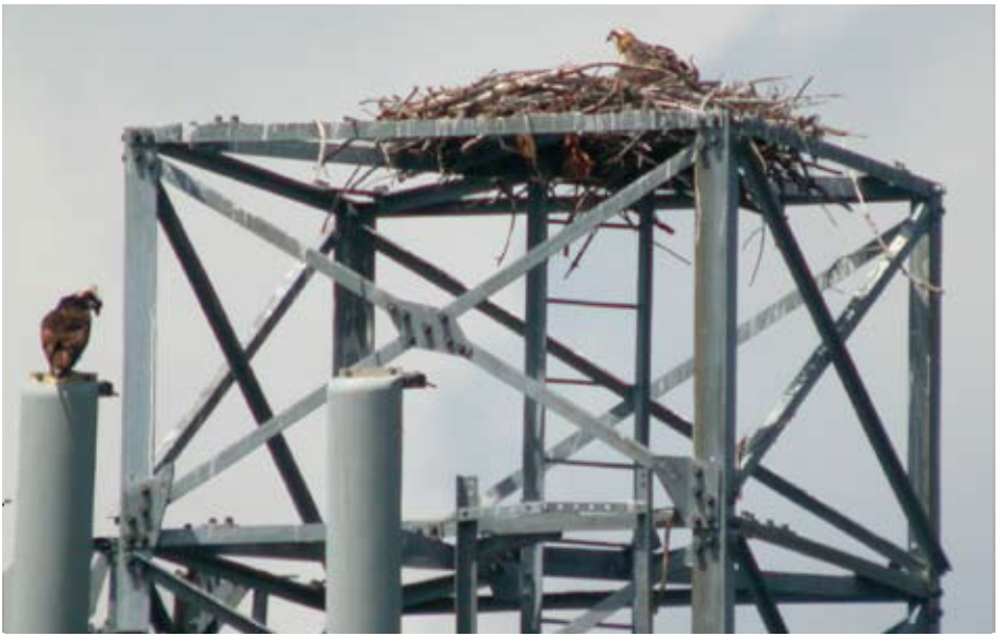
Osprey chick and mom at cell tower nest in Laconia, NH. Photo by Iain MacLeod, 7/18/10.

Elsewhere, 10 pairs reared a Lake Region record of 19 chicks. Two new nests were found; both on cell towers. The first, on an enormous tower in Tilton, was reported to Chris Martin in May. I checked it on May 5 and found a female incubating in a small (new) nest. This pair hatched at least one chick but the pair failed shortly after hatch likely because of a severe storm and was building a frustration nest in late July on a nearby utility pole.