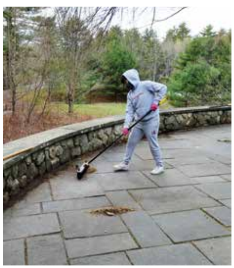
A volunteer from Moultonborough Academy sweeps the Bluestone Terrace.