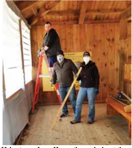
Volunteers from Hypertherm help at the Bear Exhibit.