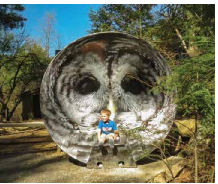
A young visitor tests the owl sound dishes.

Now with your eyes still closed, cup your hands behind your ears and listen again. Are the sounds louder? Can you hear other sounds you didn't hear before? Listen silently, like an owl, and slowly turn your head and body. After several minutes, place your hands in your lap and focus on the sound of your own breathing. Slowly count ten deep breaths in and out. Open your eyes and see what you've been hearing.