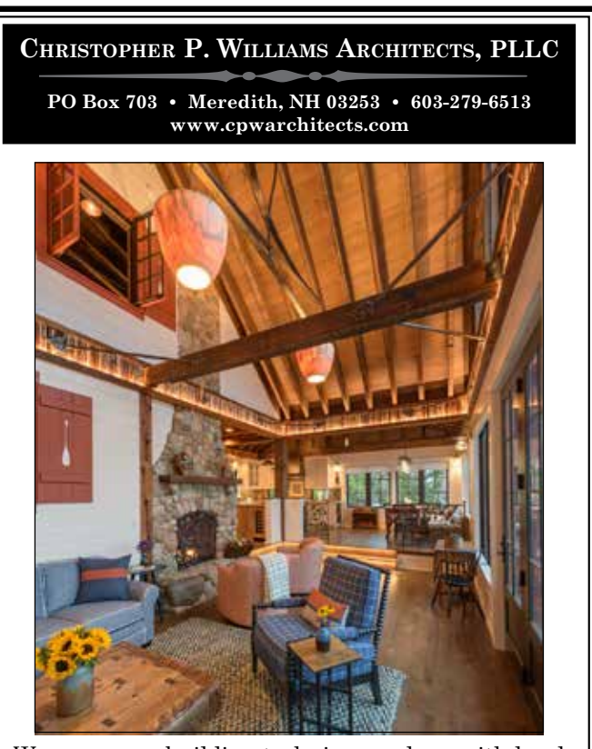
We use green building techniques, along with local craftsmen and materials, to build a home designed to suit your needs, lifestyle, and budget.

This newsletter is generously underwritten by: