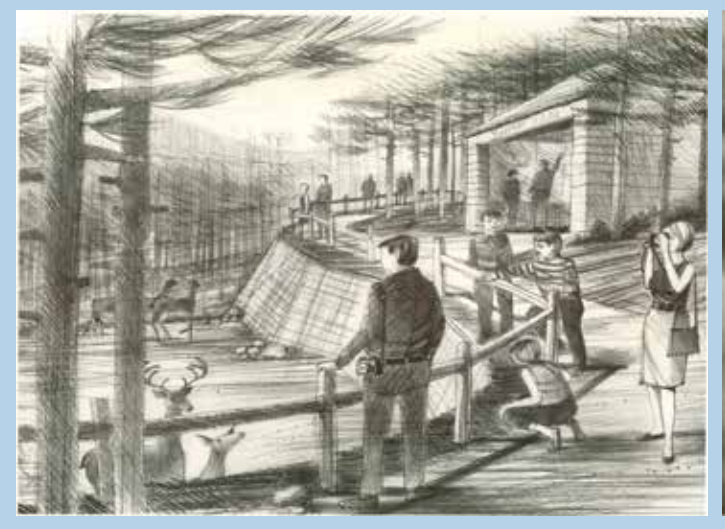
An early conceptual drawing of a White-tailed Deer Exhibit from the 1960s.

A look back at the Science Center's history in photographs.