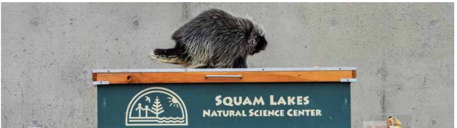
North American Porcupine