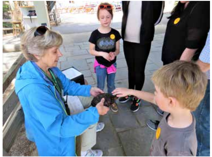
ABOVE: New Hampshire Day was spread over two days – not by design. May 6 was a rainy, cool day and many people stayed away; a second attempt took place on May 13. Between the two days, we attracted over 1,000 people to the Holderness area. This annual season kick-off was once again generously sponsored by the Dead River Company and the New Hampshire Electric Co-op Foundation.

BELOW: A few new animals joined the collection: a Fisher arrived in July and now shares an enclosure with the Gray Fox (one out in the morning and one in the afternoon). A baby Turkey Vulture was “dropped off” and hand-reared by staff. It is now an outstanding program bird. In August, a new female mink joined the program animal ranks. Black-crowned Night-herons and Cattle Egrets were added to the aviary in the Celebrate Birds Exhibit.