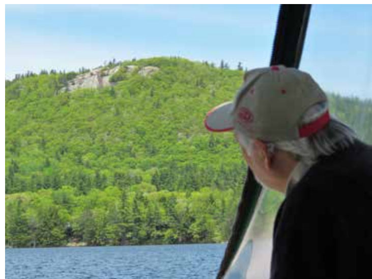
A visitor enjoys the view on a Squam Lake Cruise.