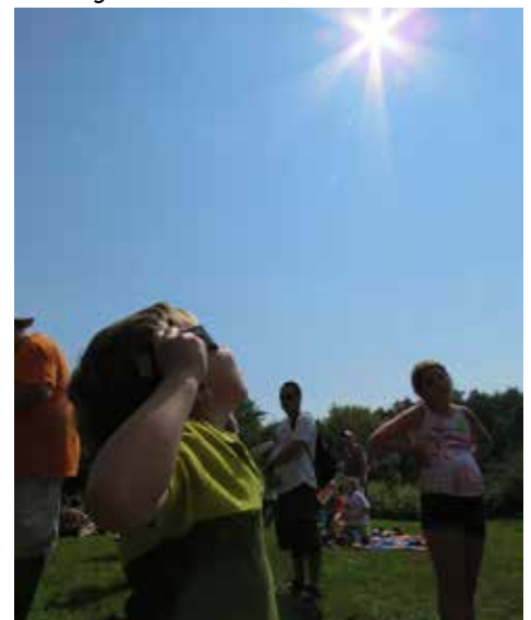
A young visitor views the August 2017 solar eclipse.