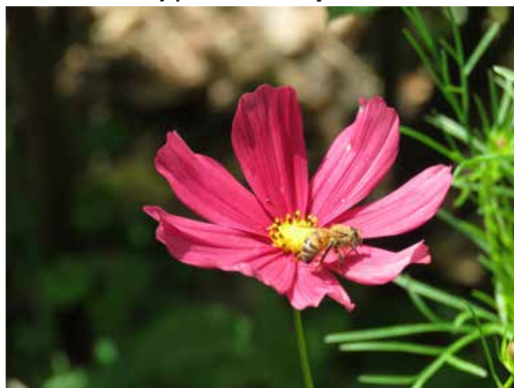
Pollinators at work in Kirkwood Gardens.

This year we again summarized our audited financial information to show the impact of our Nature Matters capital campaign in 2017 and 2016 as compared to regular operations. Complete Audited Financial Statements and the Form 990 Tax Return may be found on our website, www.nhnature.org , under the tab for Support.