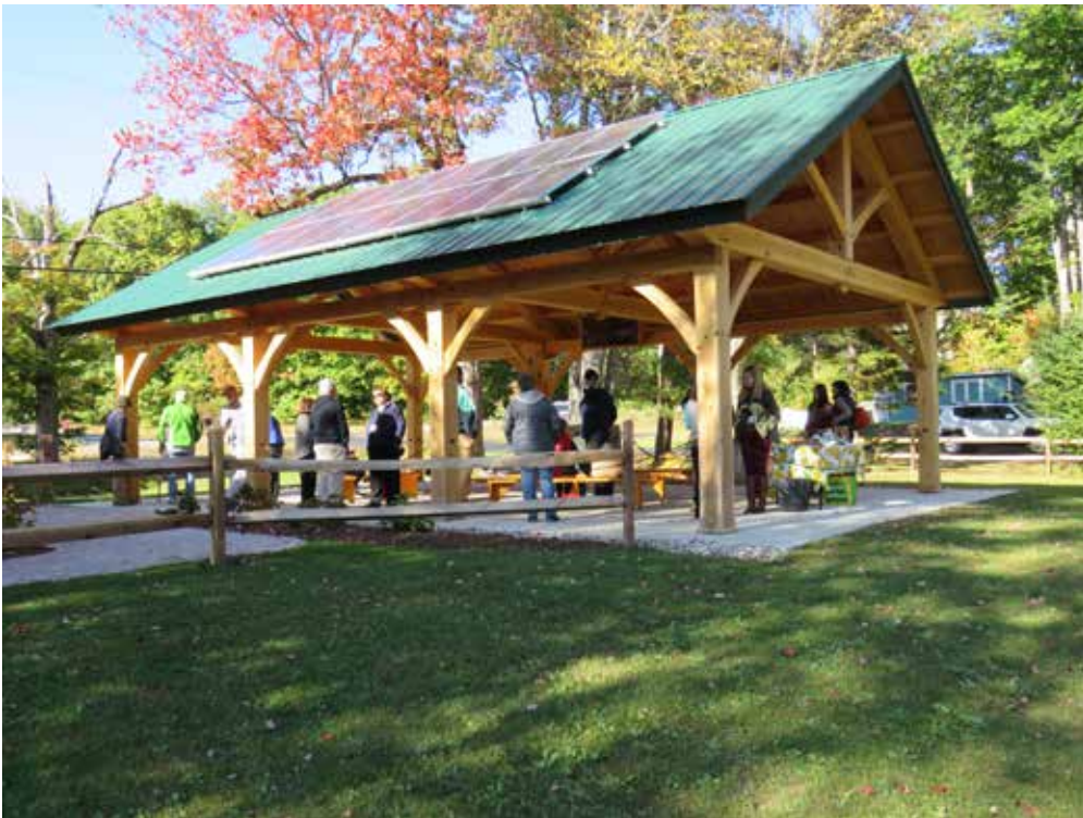
Business members and sponsors tour Lake Cruise Headquarters prior to a special cruise in the fall.