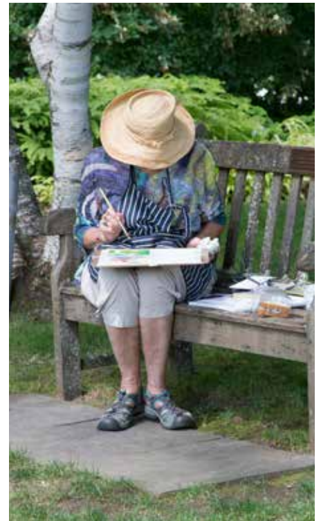
Plein Air Watercolor Painting Workshop at Kirkwood Gardens