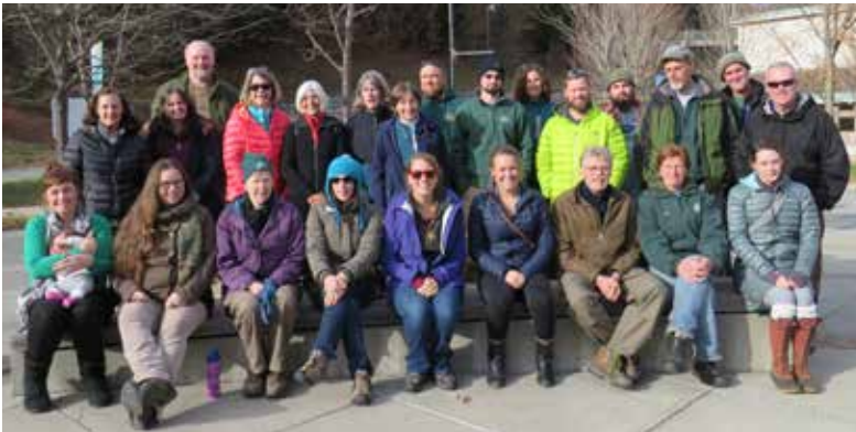
November 2017 Staff Retreat at the Montshire Museum in Norwich, Vermont.