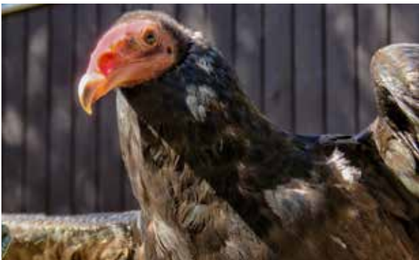
Top Left: Fisher; Left: Turkey Vulture; Above Left: Black-crowned Night-Heron; Above Right: Cattle Egret