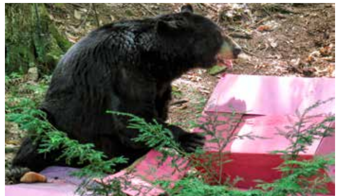
TOP: The Science Center's program coyote. TOP RIGHT: New Hampshire Fish & Game Conservation Officer and the crew from Animal Planet's North Woods Law: New Hampshire . BOTTOM RIGHT: The Science Center's black bear enjoying Christmas in July for the Critters.